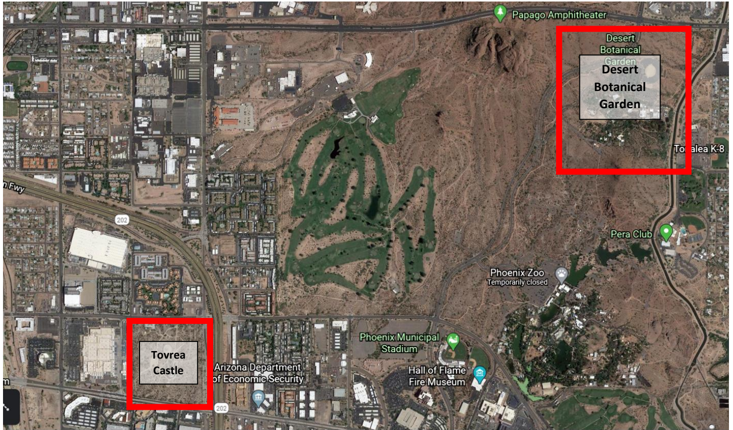
Figure 1. Location of Tovrea Castle and Desert Botanical Garden in Phoenix, AZ.