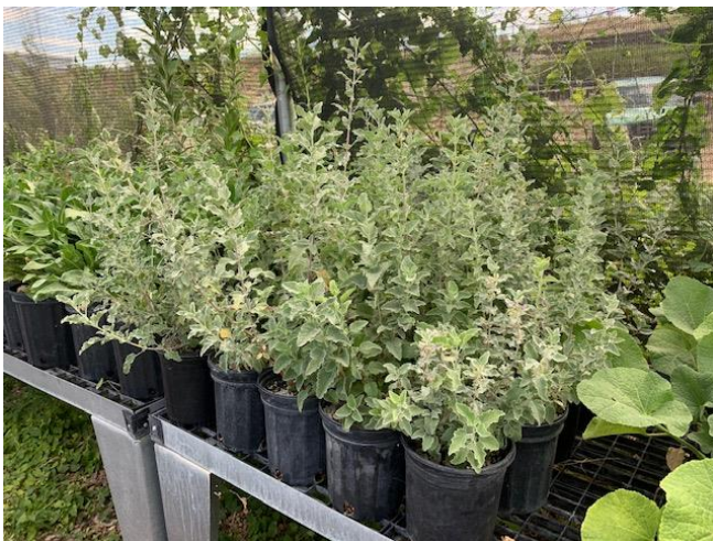
Figure 6. Desert lavender plants at the Gila Native Plant Nursery July 20, 2020.

Desert lavender plants were grown by the Gila Native Plant Nursery, however they were not of sufficient size to be included in the November 2019 planting event. Nursery Manager Steve Plath recommended installation during the monsoon or fall of 2020; there are now 20 very healthy plants (Figure 6) ready for installation at the next volunteer day [tentatively] in October. If a volunteer day is not possible, they will be installed during monitoring visits a few at a time. Coordination with the Tovrea Carraro Society will be needed on appropriate siting.