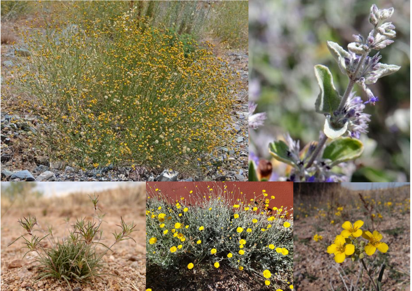
Figure 2. Sonoran Seed Collaborative Pilot Species. (TOP LEFT) Sweetbush (photo credit http://southwestdesertflora.com/WebsiteFolders/All_Species/Asteraceae/Bebbia_junceae.html ). (TOP RIGHT) desert lavender (photo credit: Carianne Campbell). (BOTTOM LEFT) Fluffgrass (photo credit: Sue Carnahan). (BOTTOM MIDDLE) Desert marigold (photo credit: Carianne Campbell). (BOTTOM RIGHT) Bladderpod (photo credit: Sue Carnahan).

COVID-19 has delayed additional planting onsite until at least October. Regardless, the team is excited to continue building on what has been learned so far and to share our “lessons learned” so that future sites can continue to be successfully developed.