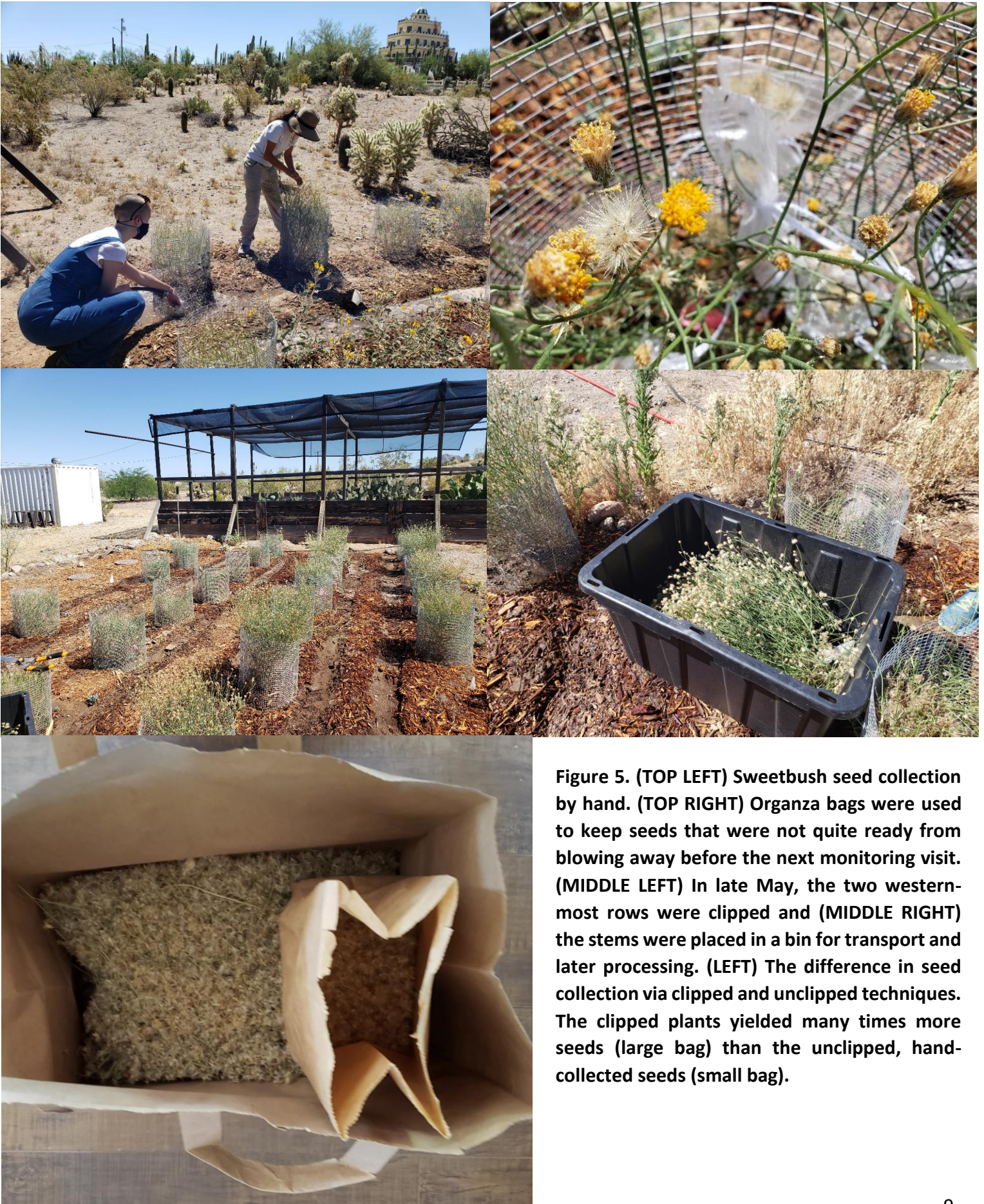
Figure 5. (TOP LEFT) Sweetbush seed collection by hand. (TOP RIGHT) Organza bags were used to keep seeds that were not quite ready from blowing away before the next monitoring visit. (MIDDLE LEFT) In late May, the two western-most rows were clipped and (MIDDLE RIGHT) the stems were placed in a bin for transport and later processing. (LEFT) The difference in seed collection via clipped and unclipped techniques. The clipped plants yielded many times more seeds (large bag) than the unclipped, hand-collected seeds (small bag).