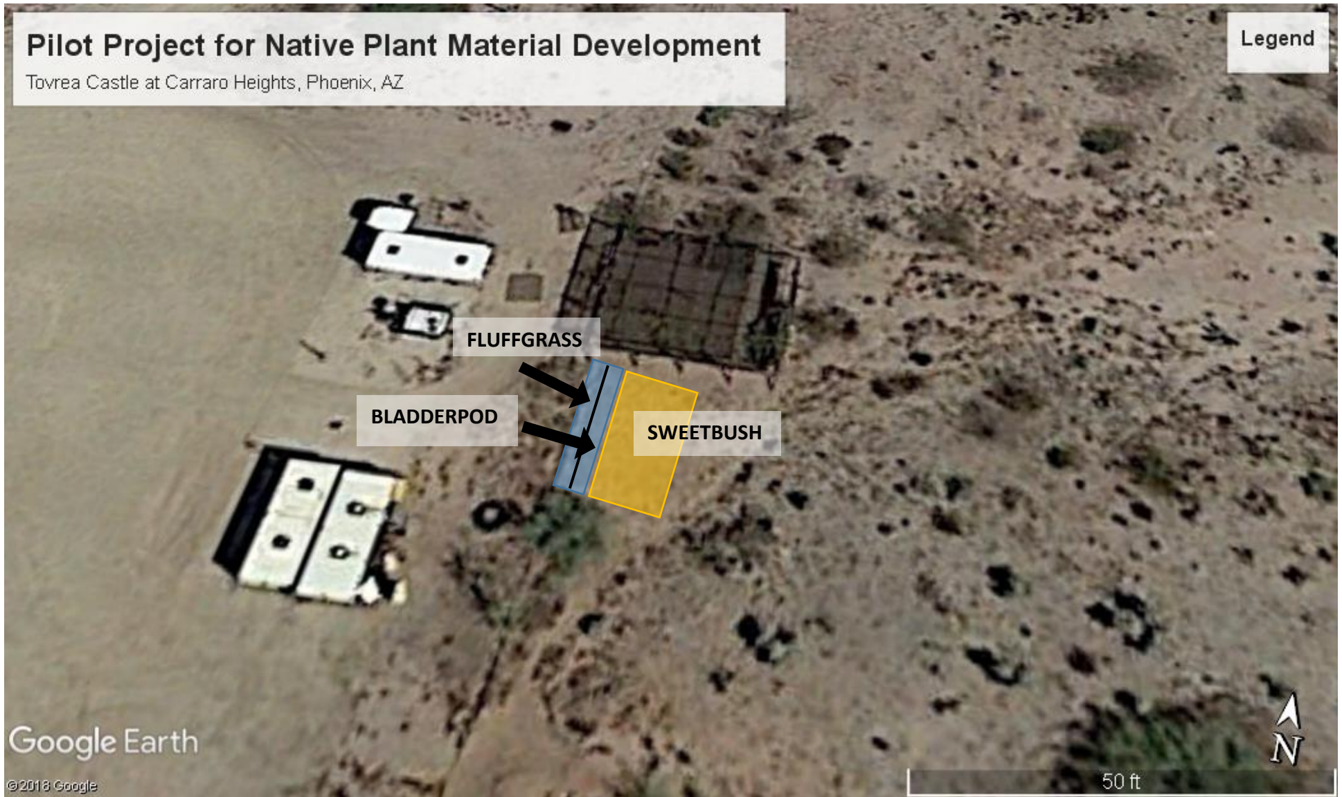
Figure 3. Location of installed/seeded plants at Tovrea Castle.