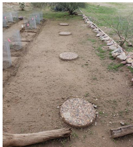
Figure 7. Plot seeded with fluffgrass and bladderpod on December 30, 2019.