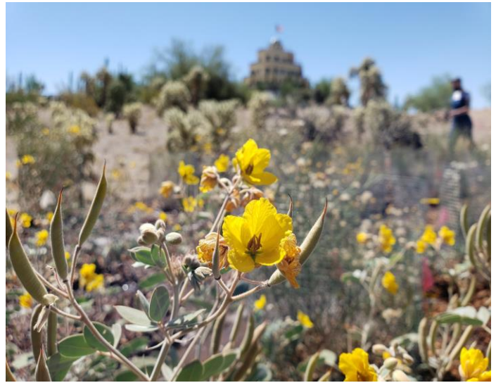
Figure 8. Desert senna at Tovrea Castle, July 6, 2020.