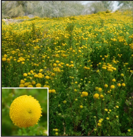
Stinknet ( Oncosiphon piluliferum ) - Plant is two to three feet tall with round globe flowers and spreading quickly.

These invasive species are outcompeting native desert species, which local wildlife depend on for food, shelter and habitat. Many of these invasive species form dense monocultures, altering the desert landscape and creating a hazardous fire risk. These species could be spreading in your area; early detection and eradication can prevent an invasion. Mapping these invaders is the first step to managing them, and preventing further spread.