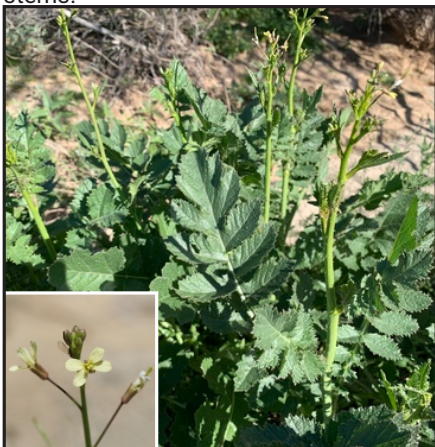
Sahara Mustard ( Brassica tournefortii ) - Butterfly shaped flowers.

Help save the Desert Habitat! To get involved in mapping these plants, please contact CAZCA at email cazca@dbg.org or call 480-481-8187. Or contact Maricopa County Parks Volunteer Coordinator at email parkvolunteer@maricopa.gov or call 602 506-9510.