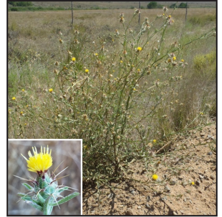
Malta Star Thistle ( Centaurea melitensis ) - Sharp spines at base, deeply lobed leaves with whitish appearance.