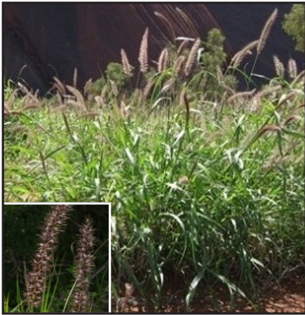
Buffelgrass ( Pennisetum ciliare ) - Bunched grass with round reddish stems.