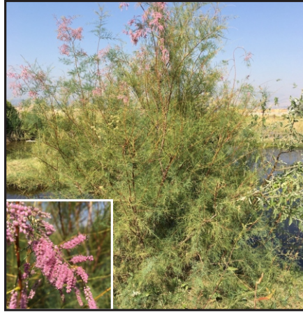
Salt Cedar ( Tamarix spp. ) - 20 to 25 feet tall, feathery appearance, small bright pink flowers.