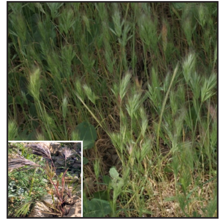
Red Brome Foxtail ( Bromus rubens ) - Dense panicle with purplish tinge.