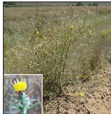
Malta Star Thistle ( Centaurea melitensis ) - Sharp spines at base, deeply lobed leaves with whitish appearance.