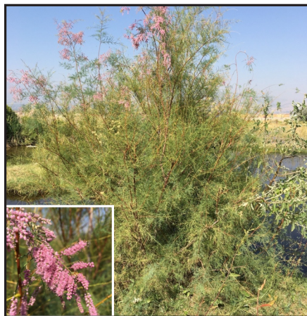
Salt Cedar ( Tamarix spp. ) - 20 to 25 feet tall, feathery appearance, small bright pink flowers.