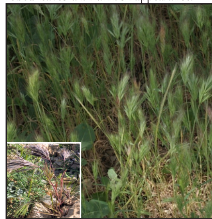
Red Brome Foxtail ( Bromus rubens ) - Dense panicle with purplish tinge.