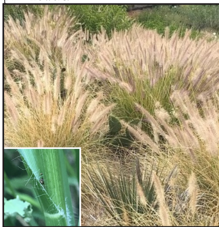
Fountain Grass ( Pennisetum setaceum ) - Purplish upright stems with long inflorescence.