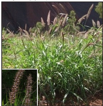
Buffelgrass ( Pennisetum ciliare ) - Bunched grass with round reddish stems.