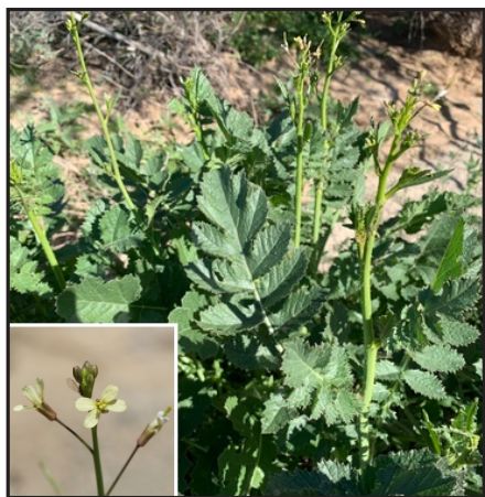
Sahara Mustard ( Brassica tournefortii ) - Butterfly shaped flowers.

Help save the Desert Habitat! To get involved in mapping these plants, please contact CAZCA at email cazca@dbg.org or call 480-481-8187. Or contact Maricopa County Parks Volunteer Coordinator at email parkvolunteer@mail.maricopa.gov or call 602 506-9510.