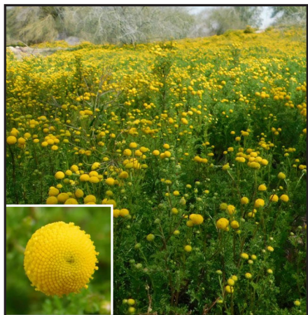
Stinknet ( Oncosiphon piluliferum ) - Plant is two to three feet tall with round globe flowers and spreading quickly.

These invasive species are outcompeting native desert species, which local wildlife depend on for food, shelter and habitat. Many of these invasive species form dense monocultures, altering the desert landscape and creating a hazardous fire risk. These species could be spreading in your area; early detection and eradication can prevent an invasion. Mapping these invaders is the first step to managing them, and preventing further spread.